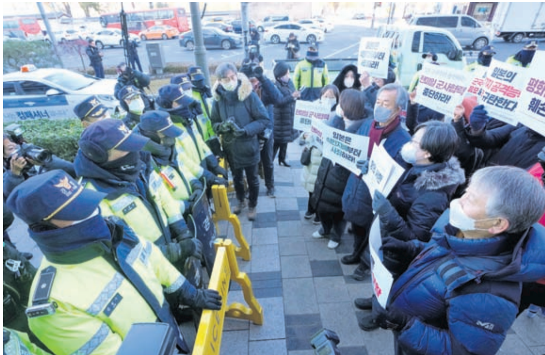
Protesters confront police officers during a rally to oppose Japan’s adoption of a new national security strategy near the Japanese Embassy in Seoul, South Korea, Tuesday, Dec. 20, 2022.

“Japan’s foolish attempt to satiate its black-hearted greed the building up of its military invasion capability under the pretext of (North Korea’s) legitimate exercise of the right to self-defense cannot be justified and tolerated,” an uniden-